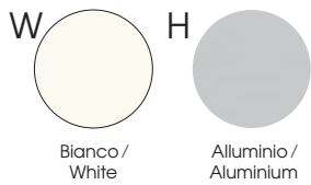
Bianco / White Alluminio / Aluminium

Gambe terminali - intermedie in tubolare metallico / Tubular metal end - intermediate legs