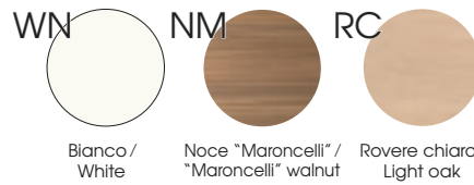
Bianco / White Noce "Maroncelli" / "Maroncelli" walnut Rovere chiaro / Light oak

Piani di lavoro sp. 1.8 cm, in melaminico / Worktops 1.8 cm thick, in melamine