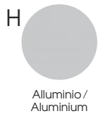
Alluminio / Aluminium

Zoccoli e profili in alluminio / Base metal frames and profiles in aluminium